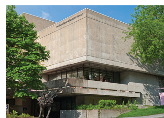
PAVILION Liliane and David M. Stewart DECORATIVE ARTS AND DESIGN

S1 Cinéma du Musée Maxwell Cummings Auditorium Entrance at 1379A Sherbrooke St. W.