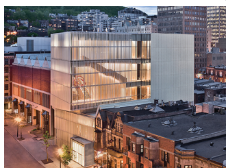
PAVILION Michal and Renata Hornstein Pavilion for Peace INTERNATIONAL ART AND EDUCATION

1 Decorative Arts and Design Section temporarily closed