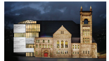
Claire and Marc Bourgie PAVILION QUEBEC AND CANADIAN ART

1 The Salons of the Belle Époque Modern Avant-garde Abstraction and Figuration Contemporary Art Access to the other pavilions