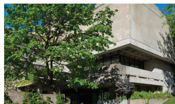
Liliane and David M. Stewart PAVILION DECORATIVE ARTS AND DESIGN

S1 Cinéma du Musée Maxwell Cummings Auditorium Entrance at 1379-A Sherbrooke St. W.