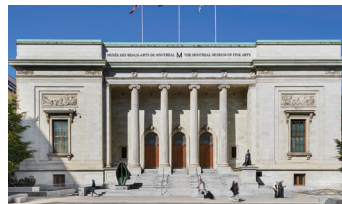
Michal and Renata Hornstein PAVILION

S2 International Contemporary Art Richard Avedon: Immortal. Portraits of Aging, 1951-2004 Comfort and Indifference: Recent Acquisitions by the MAC